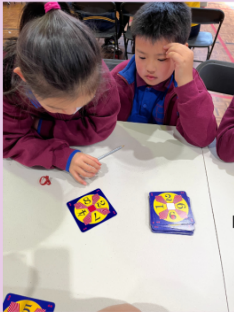
Playing 24 in pairs, against other students